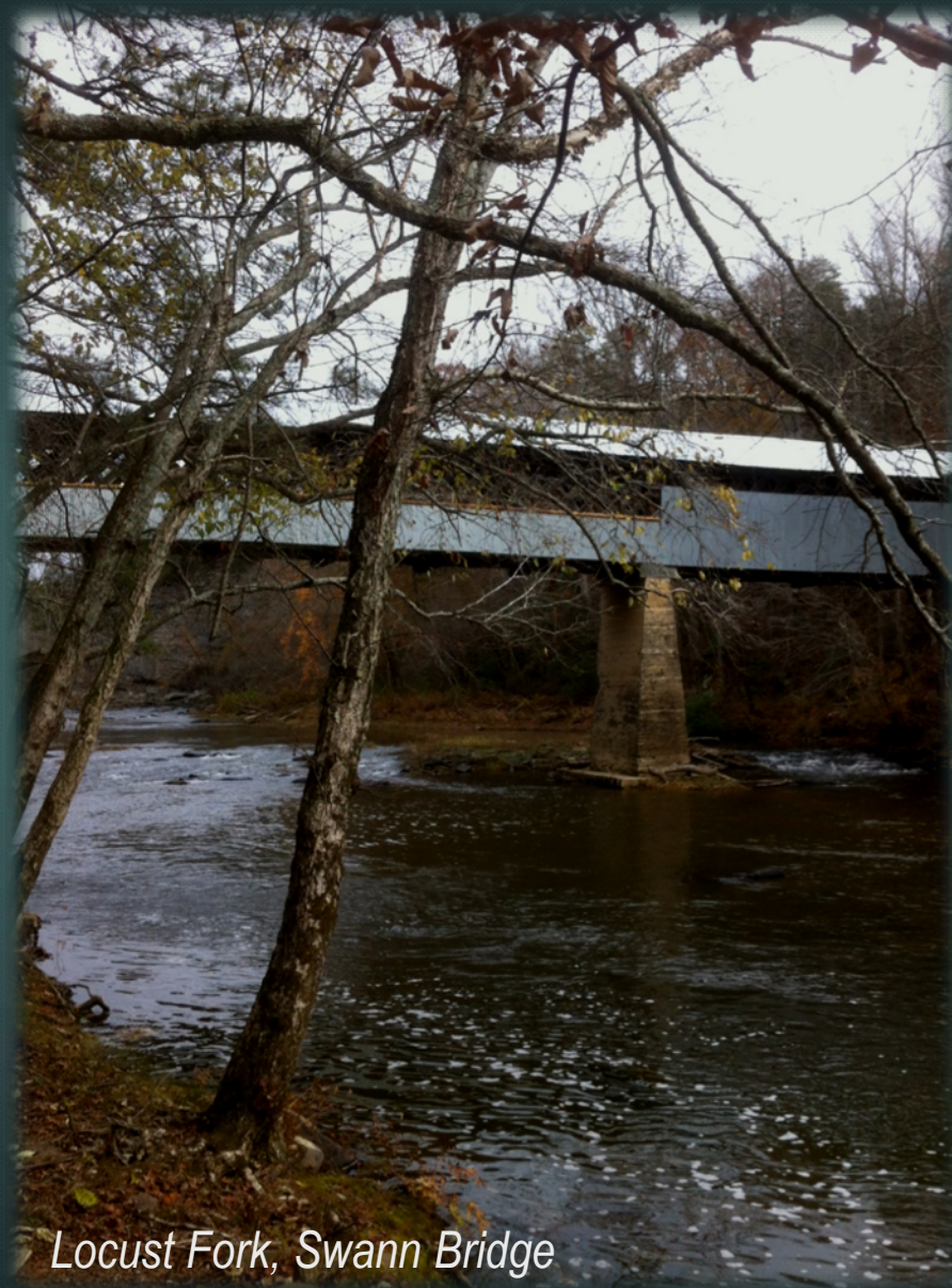
Locust Fork, Swann Bridge