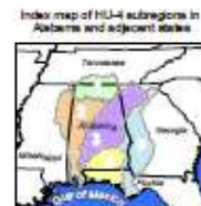
Strategic Habitat Units (SHUs) and Strategic River Reach Units (SRRUs) in Alabama and adjoining states