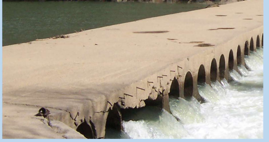
Alabama Wildlife Federation Magazine Winter 2020